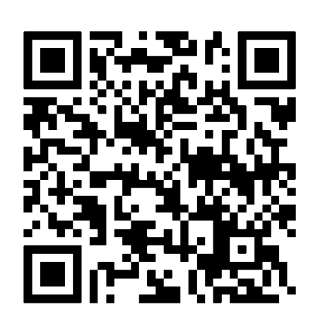
Scan To Open Link