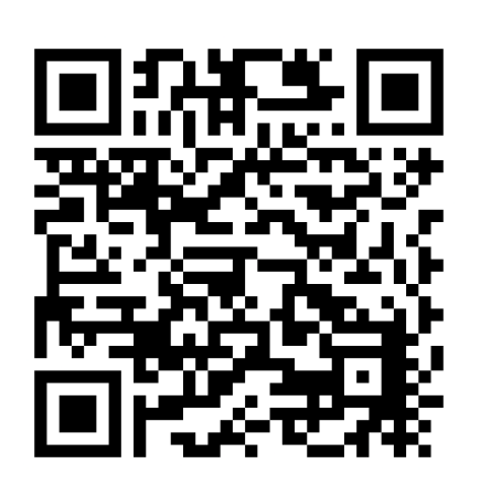
Scan To Open Link