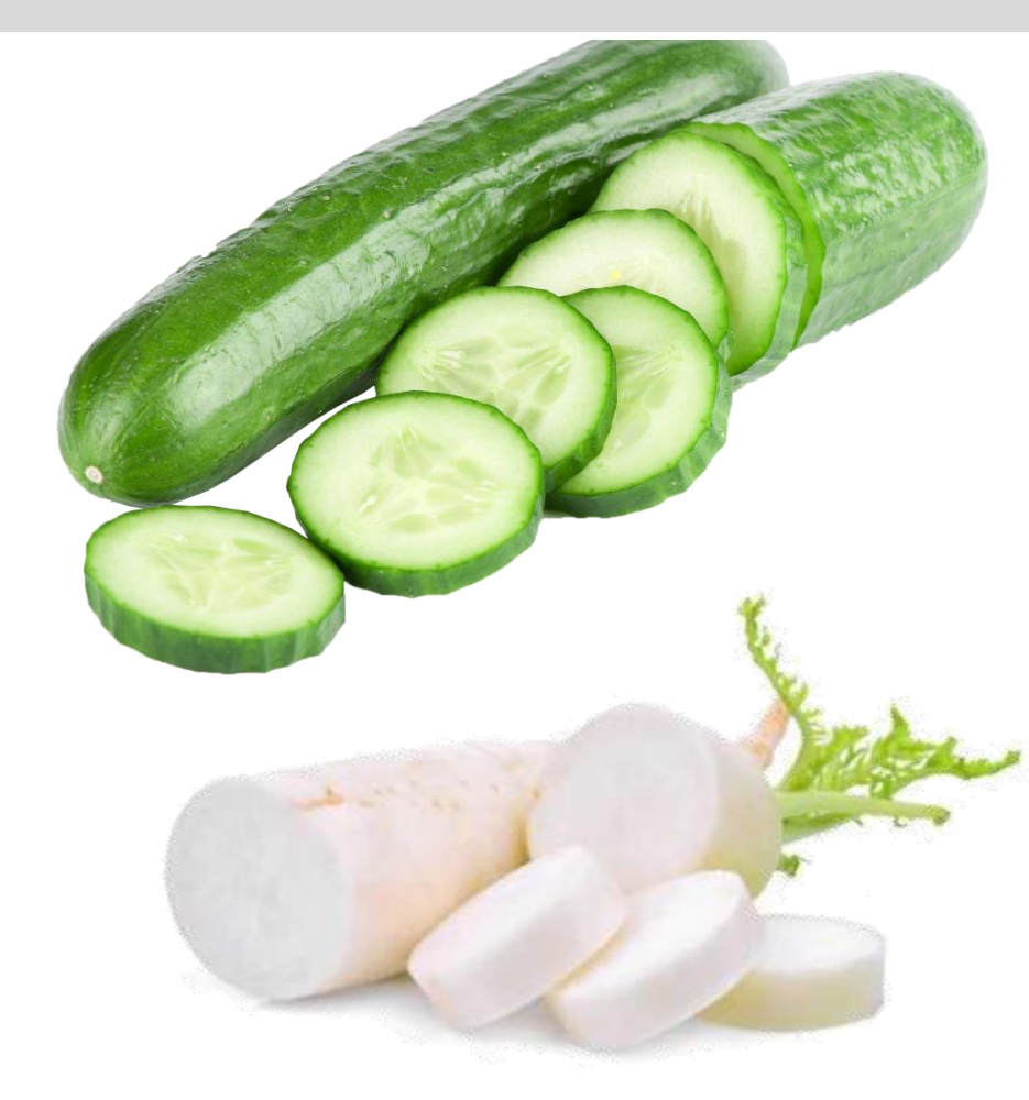
Vegetable Fruit Slice