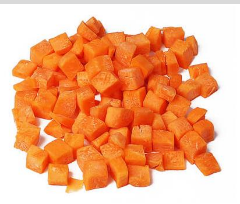
Vegetable Fruit Cube