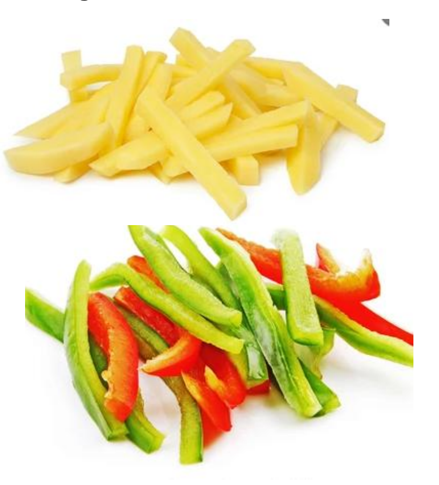
Vegetable Fruit Strips