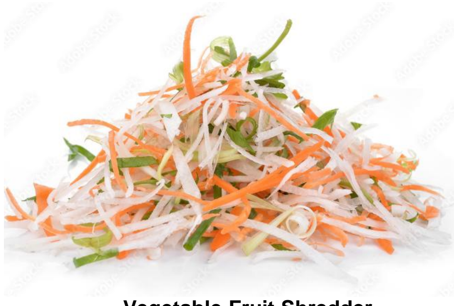
Vegetable Fruit Shredder