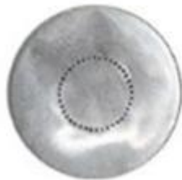
Triangle rice dumpling