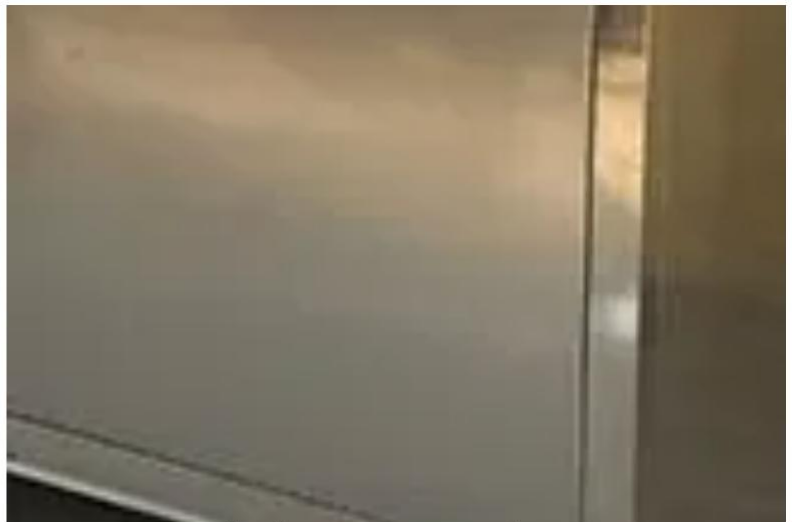
304 Stainless steel