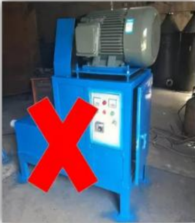
The machine made by small factory poor welding poor painting