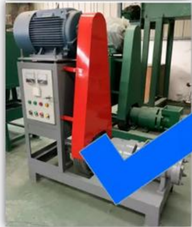
The machine made by my factory quality welding nice painting