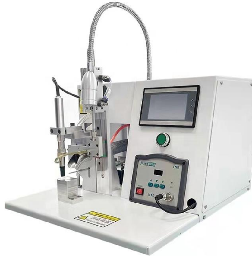
High Speed With Holding Die Spot Soldering Machine

https://www.topsell.in/mobile-usb-data-cable-making-machine-price.php