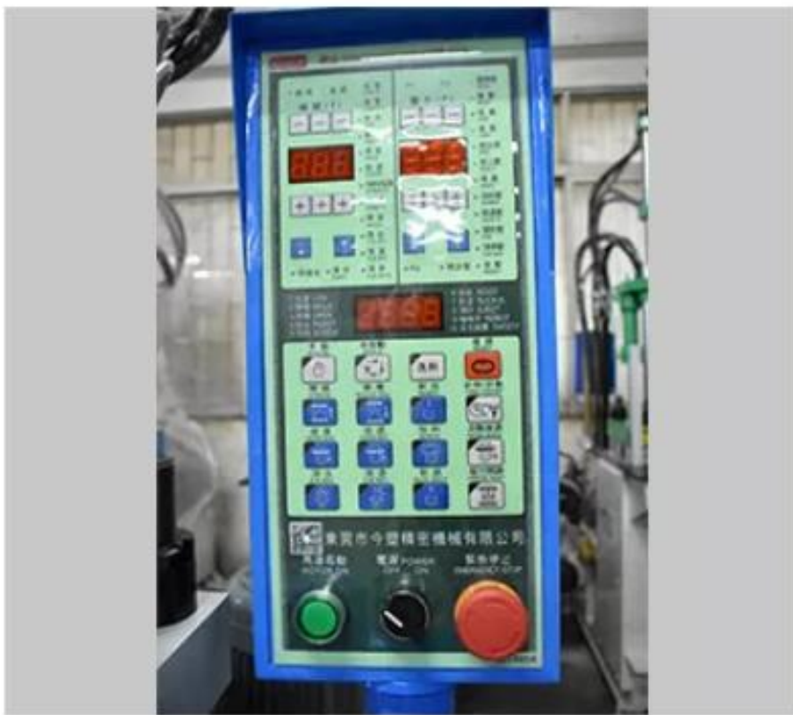
Jinpan 103A computer control