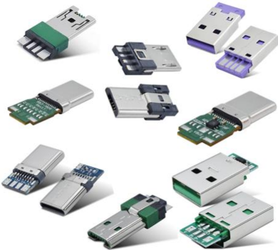
All USB Cable Connector