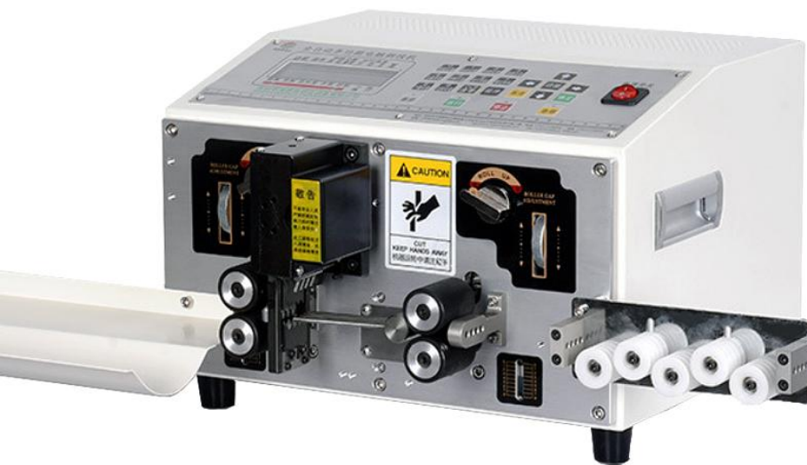
Automatic Cable Electric Wire Stripping And Cutting Machine

https://www.topsell.in/Wire-cable-cutting-and-stripping-stripper-machine.php