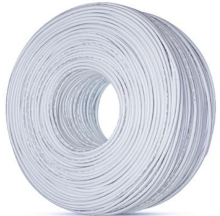
USB Cable Roll Bundle And All Type Data Cable Roll

https://www.topsell.in/Port-micro-usb-type-c-pin-female-connector-port.php