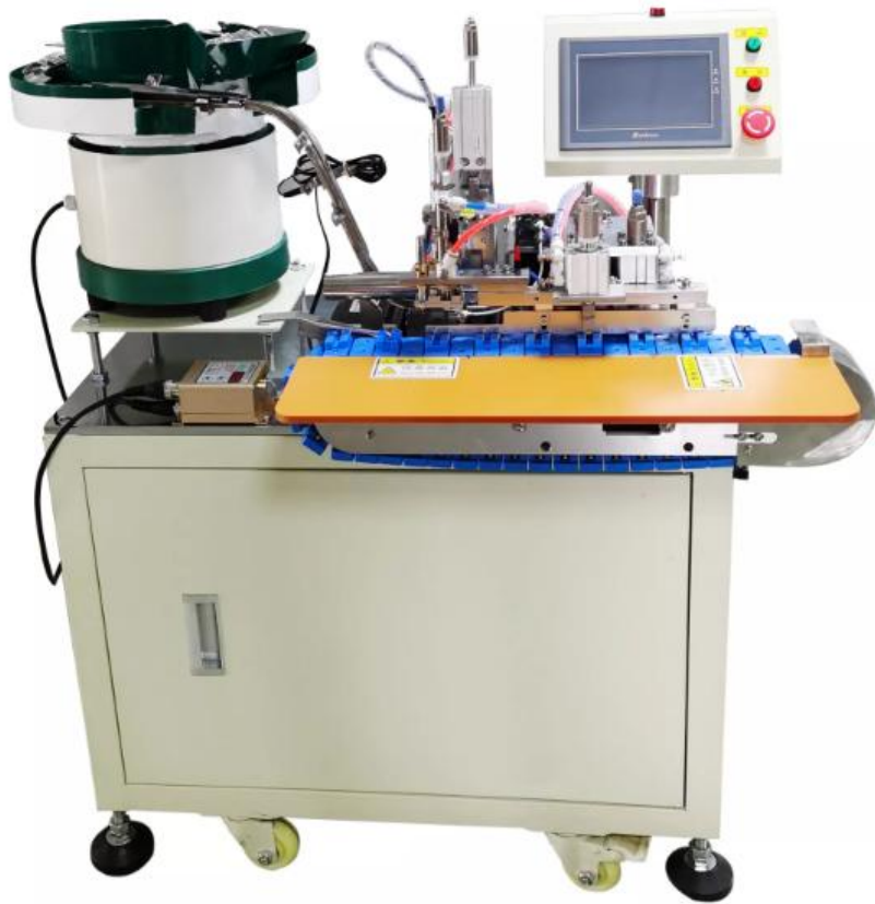
Automatic USB Wire Connector Soldering Machine

https://www.topsell.in/mobile-usb-data-cable-making-machine-price.php