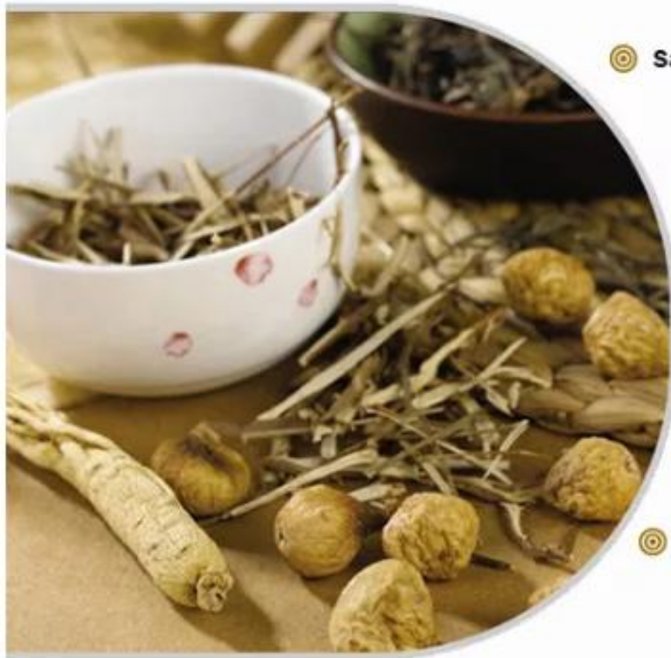
☉ Sanqi powder