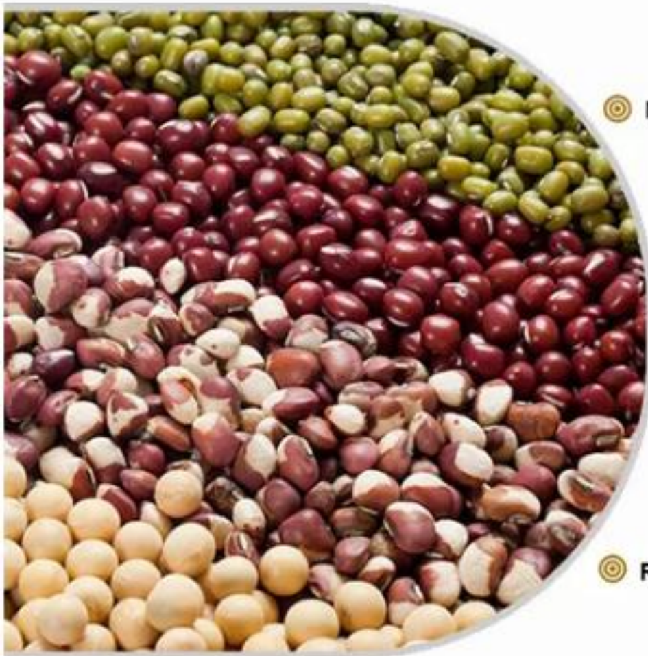
☉ Mung bean powder