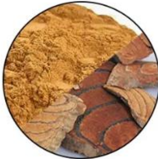
Fiber Materials Chicken blood worm fed