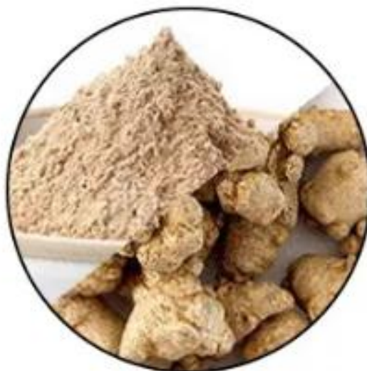
Hard material Panax notoginseng resin