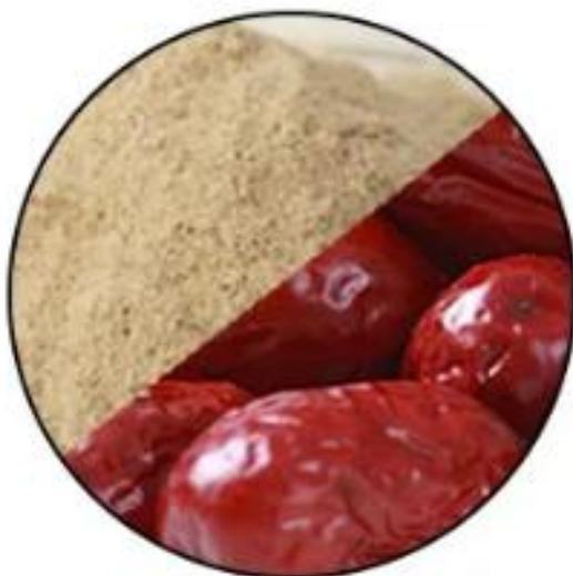
Suger Materials Jujube wolfberry rock sugar