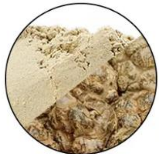
Medicinal materials Angelica sinensis/etc