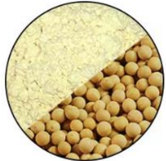
Dry ingredients soybeans/mung beans/etc