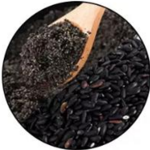
Oil based material peanut/walnut/sesame