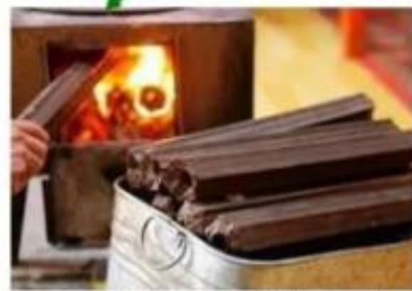
Making wood charcoal