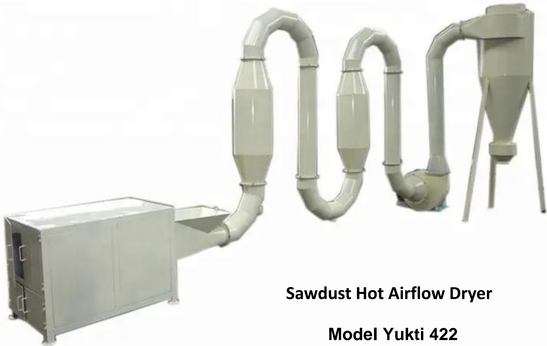
Sawdust Hot Airflow Dryer