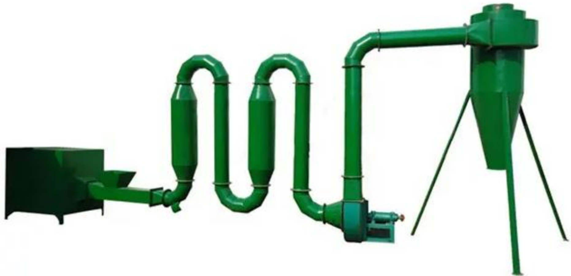
Sawdust Hot Airflow Dryer