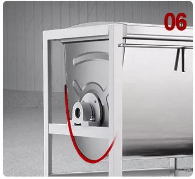
saving time and effort