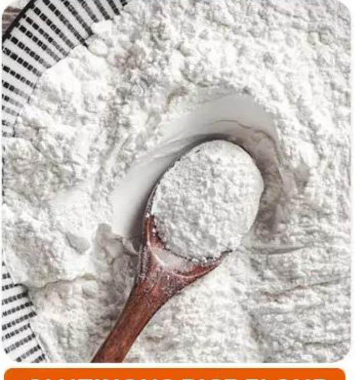
GLUTINOUS RICE FLOUR