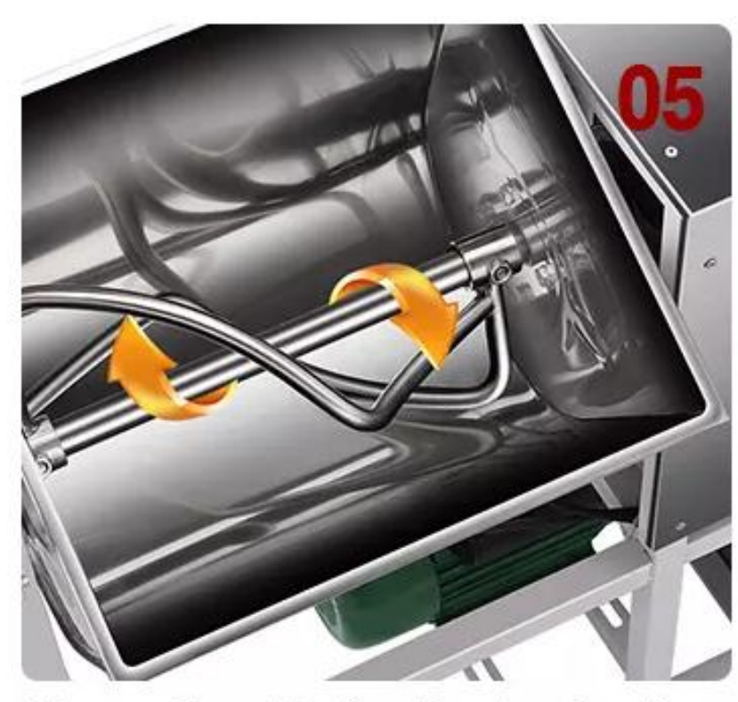
More uniform bi-directional and surface