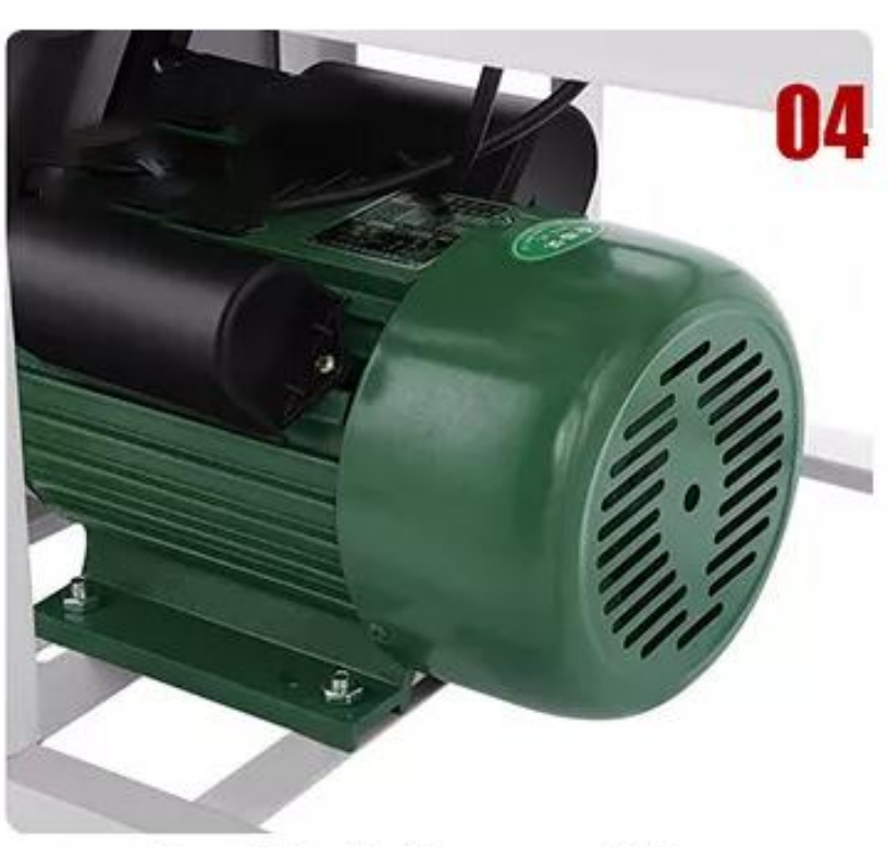
Double belt gear drive