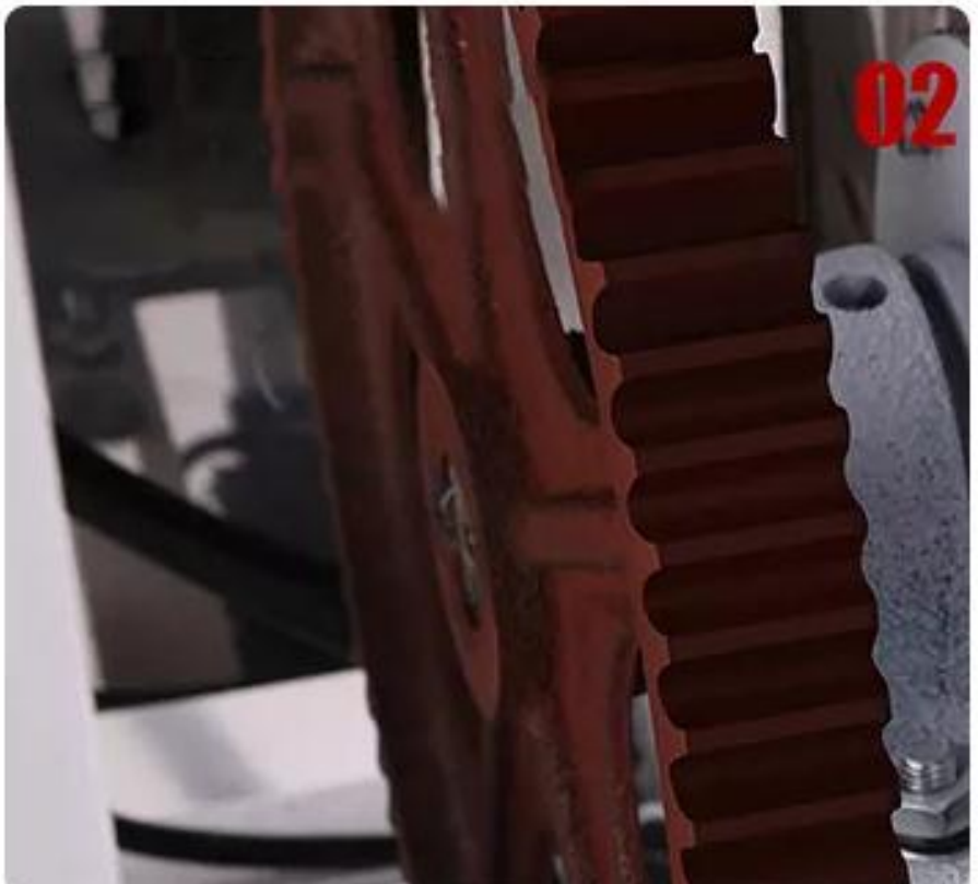
Stainless steel surface barrel