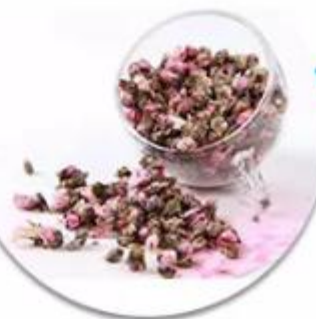
Health care tea