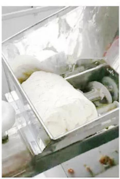
2.Put the dough into the machine bowl.