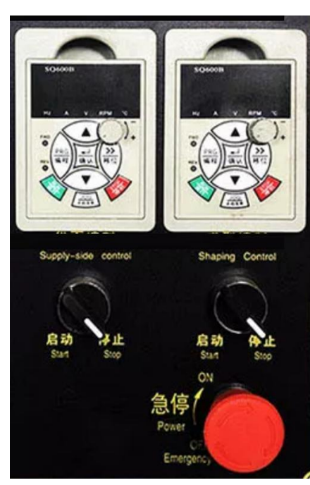
4.Turn on the main switch and adjust the appropriate amount flour and filling.