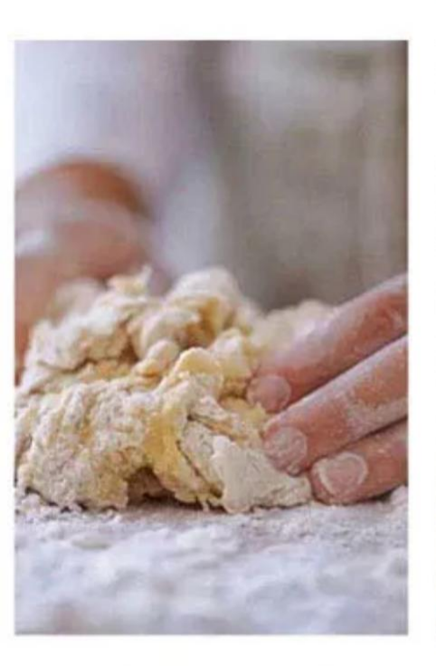
1.Knead flour and water in proper proportion.