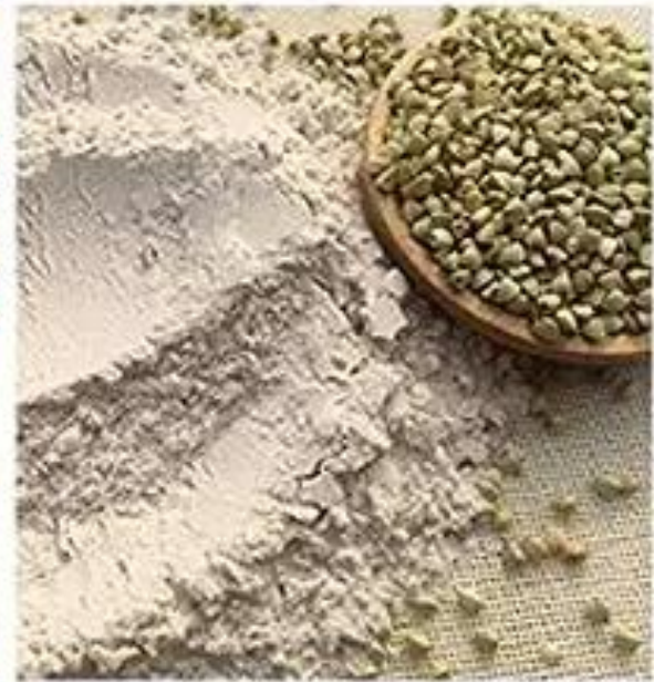
The headstrong wheat flour