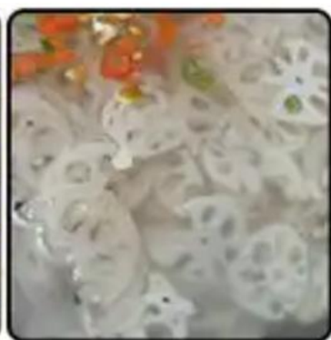
Lotus root slices