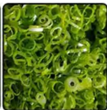
chopped green onion