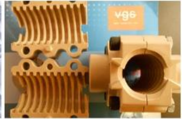
Defective injection molded parts