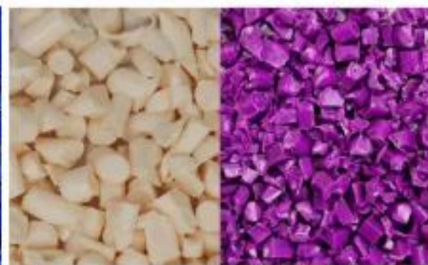
Gate material/ Defective plastic parts Can be crushed to 2mm-50mm