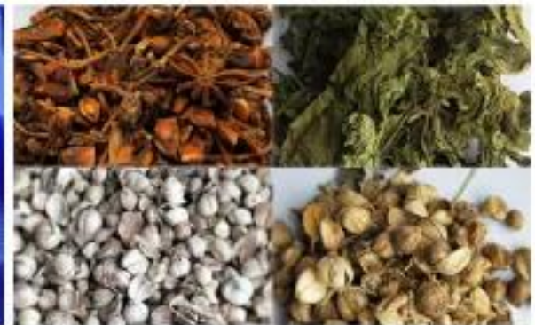
Spices such as Bay leaf, barley

In addition, it is also suitable for different packaging materials, plastic products, machine head materials, dried vegetables, agglomerates, sand, flower mud, seasoning sauces, chemical materials, vegetables, agricultural feeds, etc. All of them can be crushed.