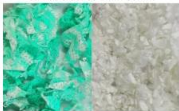
Non-woven fabric Can be crushed to 2mm-300mm