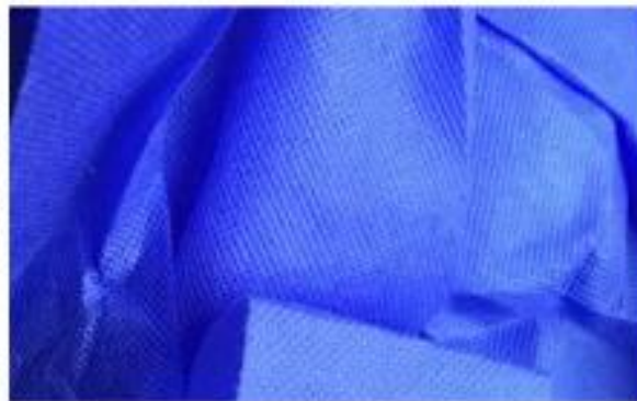
Non-woven fabric/ clothing/fabric