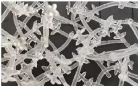
Soft rubber / elastic material