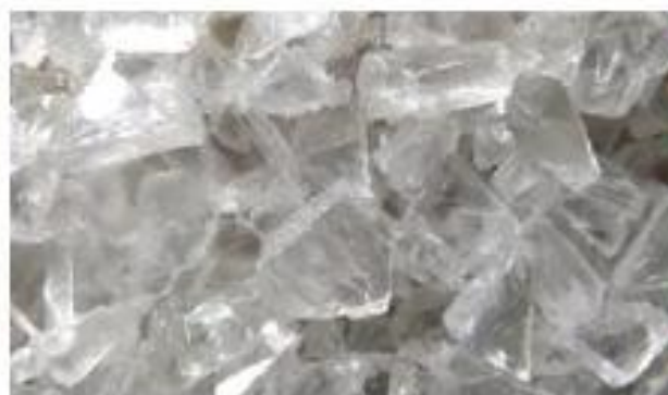
PC transparent material Can be crushed to 2mm-50mm