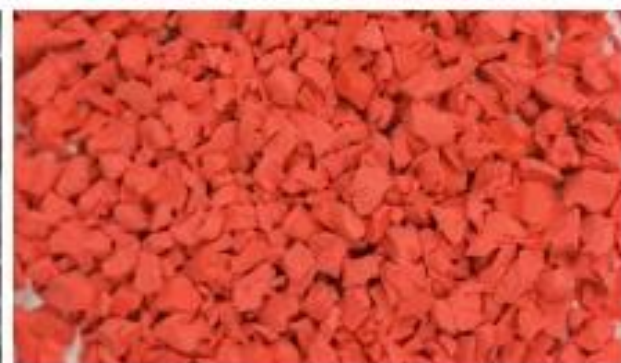
Soft rubber material/ Elastic material Can be crushed to 2mm-50mm