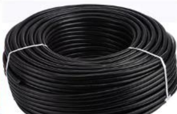
Cables and Cords