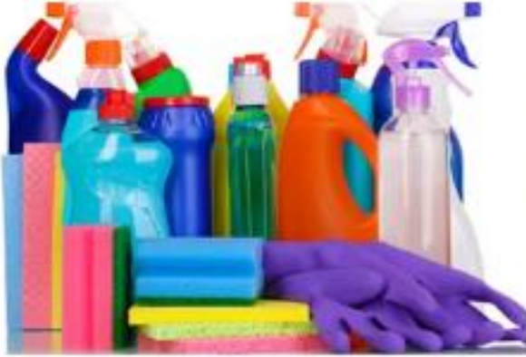
Dish washing liquid bottle/ scouring pad, etc.