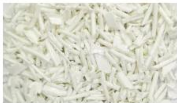
Thin rod/plastic rod Can be crushed to 2mm-50mm