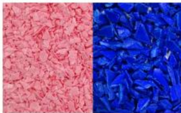
Bottle/pot/can/barrel and other sheets Can be crushed to 2mm-50mm