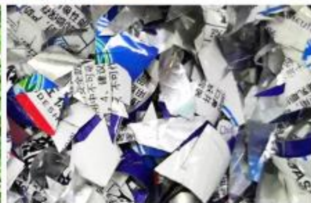
Plastic Packaging/Packing bags Can be crushed to 1mm-50mm