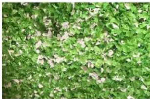
Drink Straw Can be crushed to 1mm-30mm