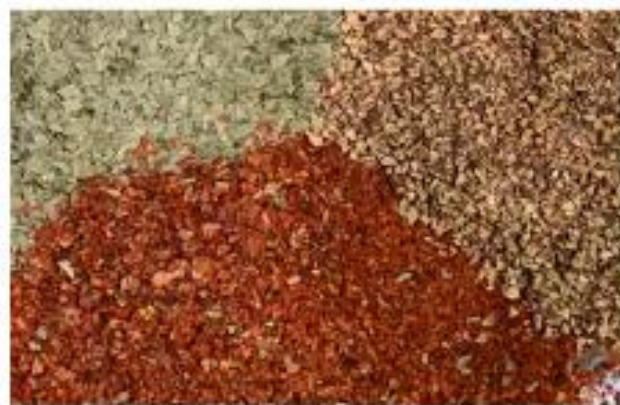
Herbs/Chili and other spices Chinese herbal medicine Can be crushed 1mm-50mm