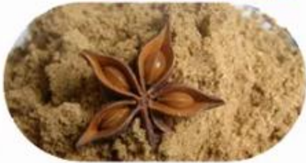
◎ Octagonal powder