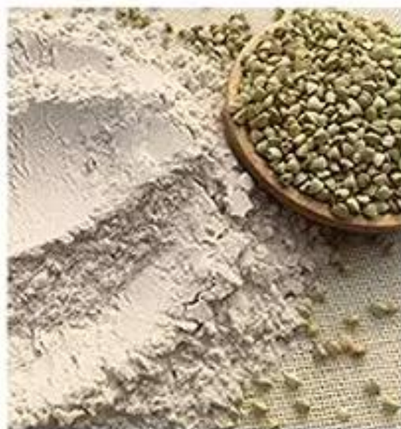
The headstrong wheat flour