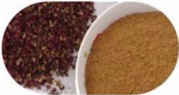
◎ pepper powder