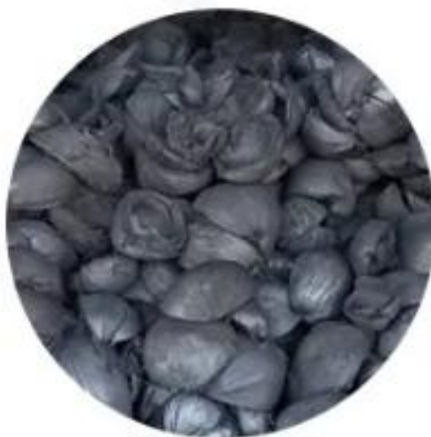
Coconut shell charcoal