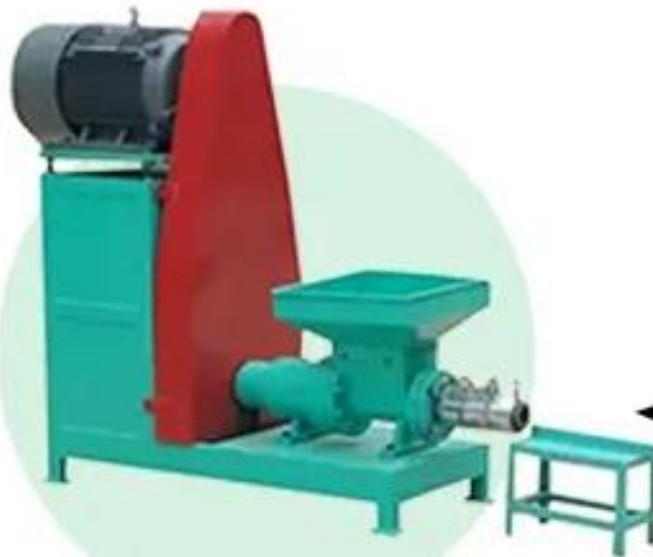
Charcoal stick making machine