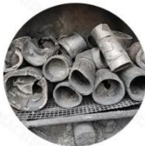
The bamboo chacoal