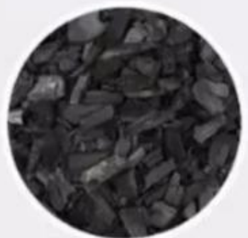
The original charcoal