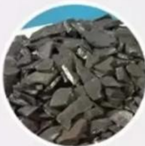
coconut shell charcoal