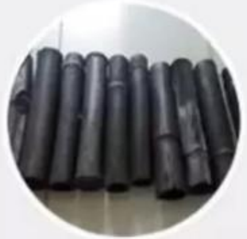
The bamboo charcoal