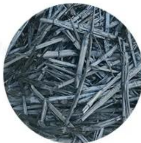
Sorghum stalk carbon