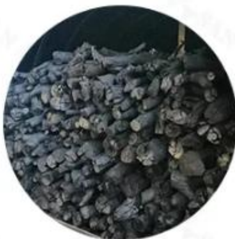
Wood branch charcoal