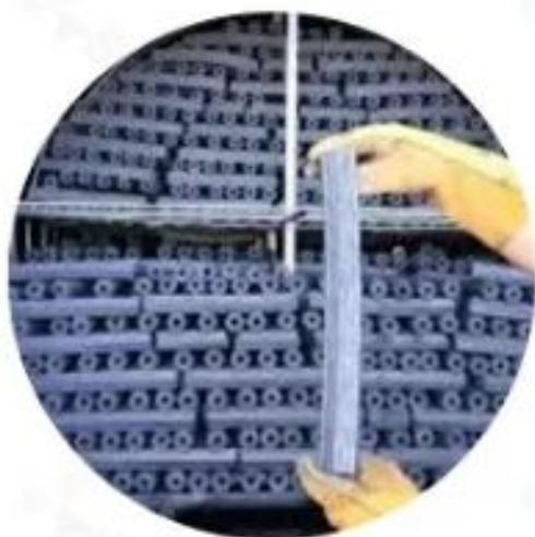
Sawdust briquette charcoal