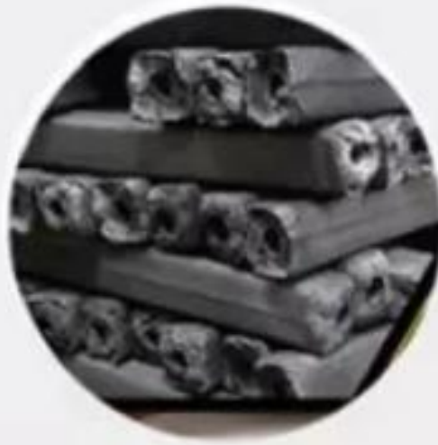
Biomass briquettes charcoal