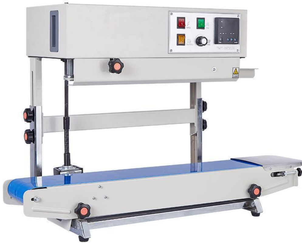
Model Yukti 115