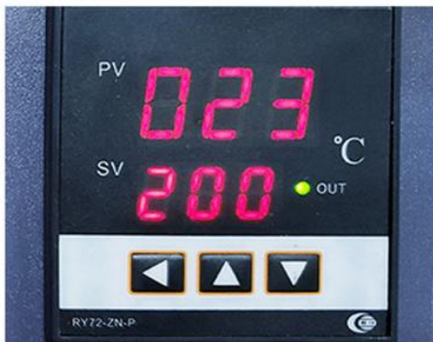
Temperature control panel

The new upgraded intelligent temperature control table, LED digital display, freely adjustable to let the temperature at a glance