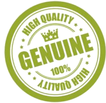
Model Yukti 114